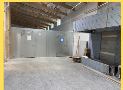
Walk in Freezer and Fridge