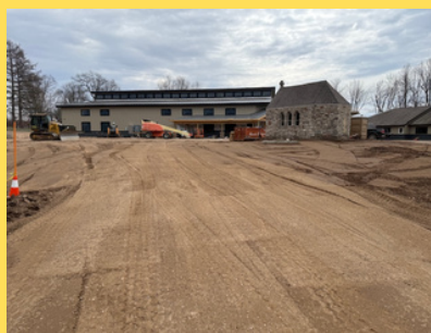
View of the Shop and Chapel